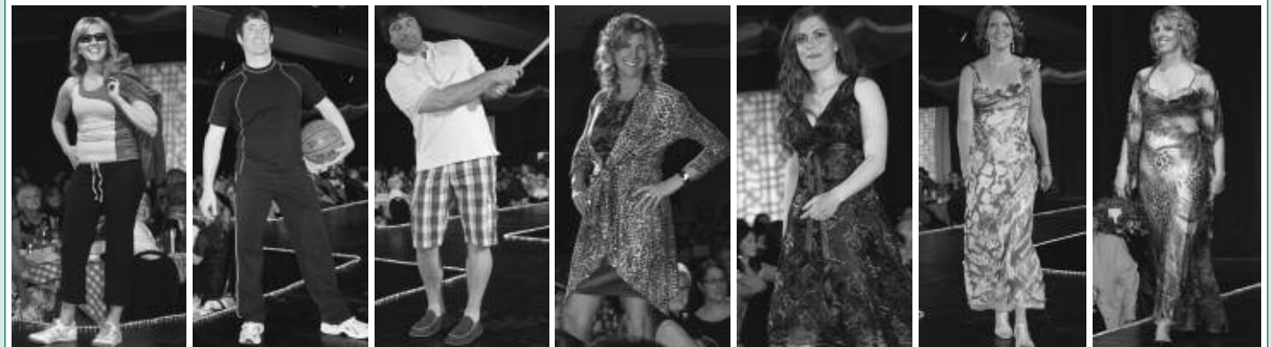
Fashions ranged from casual and athletic to classic and elegant.