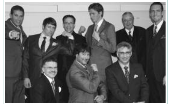
The male models ham it up before going on stage.